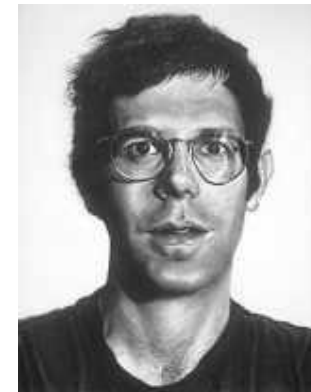
Chuck Close- photo realist drawing