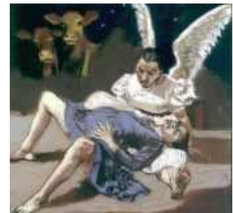
Paula Rego- narrative painting