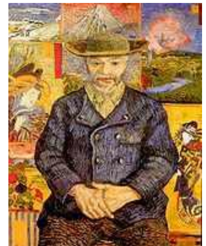
Vincent Van Gogh