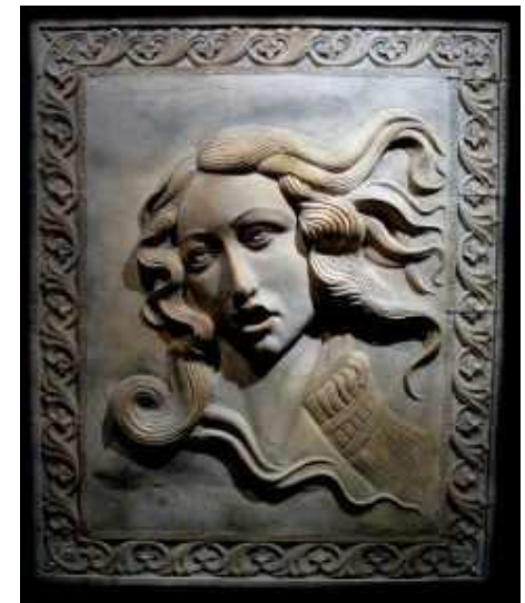
Greek Renaissance Sculptures